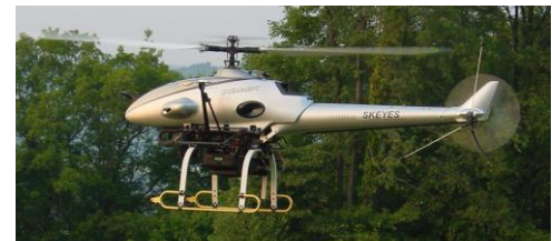
SkEyesBox onboard the RMAX.