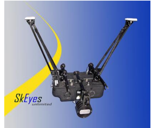
The SkEyesBox mapping system.